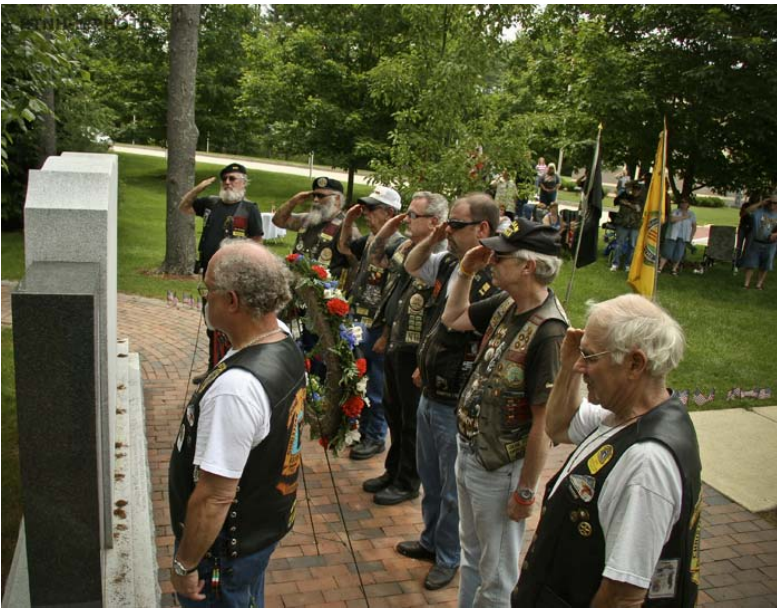
A Salute, Honoring our NH Vietnam Brothers, Boscawen Cemetery, July 5, 2008