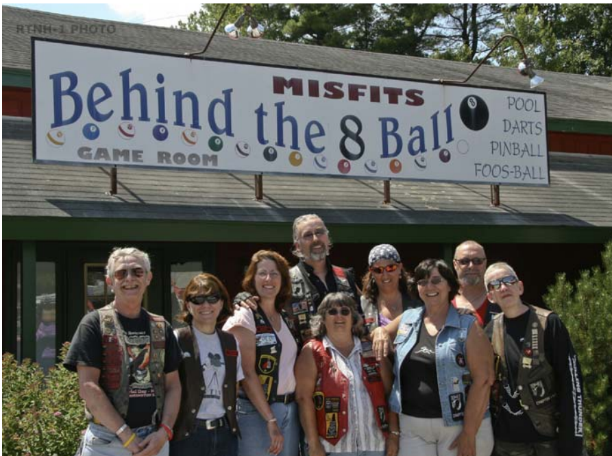
July 6, 2008 ~ The sign says it all. ~ On way to the Wall the Heals