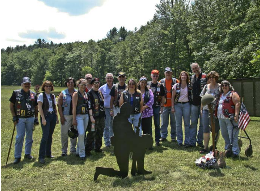
Rolling Thunder New Hampshire Chapter 1 visits the Wall that Heals July 6, 2008 China admits to taking POW