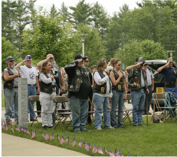
Remembering all POW/MIA/KIA's from all Past and Present Wars ~ Boscawen Cemetery, New Hampshire ~ July 5, 2008