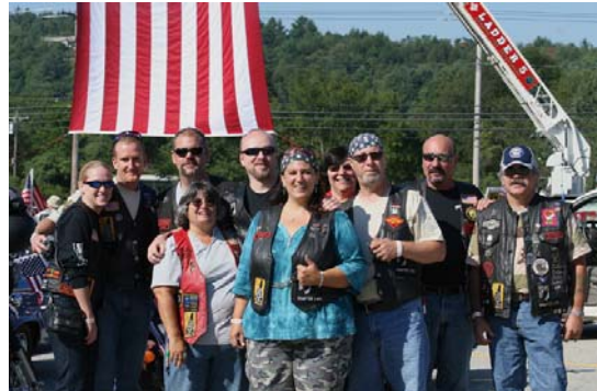
a few members of NH-1 attending, await the start of the days ride.